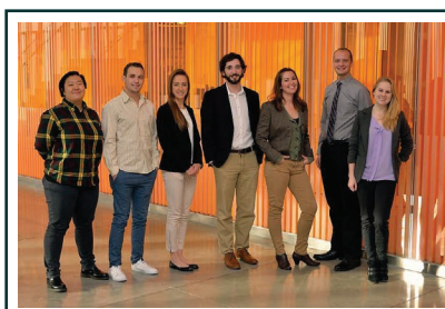
REACT fellows 2017