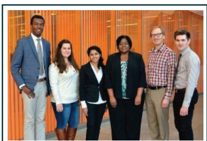
REACT fellows 2016

Register at https://react.seas.edu/events/